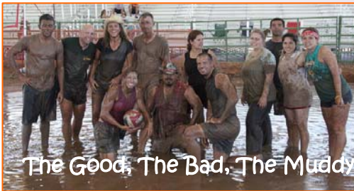
The Good, The Bad, The Muddy

Thank you Aarons for being our "Dusty Dig" Sponsor!