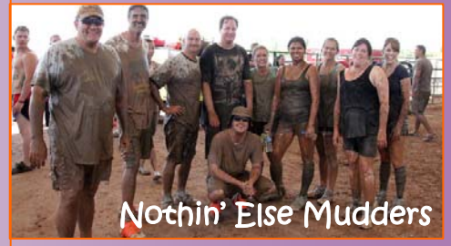
Nothin' Else Mudders